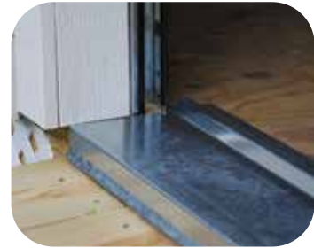
Trac-Rite's zinc-coated sill plate provides protection against sill damage and water intrusion.